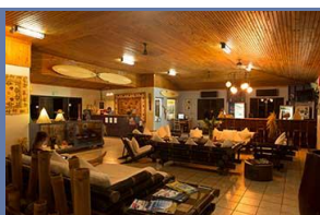
Comfort & Style