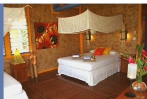
Personable & Intimate