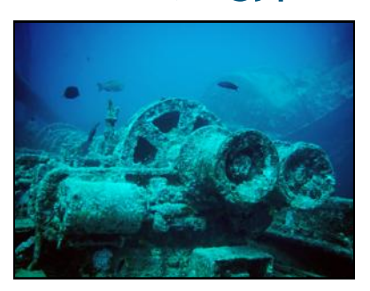
SS Thistlegorm Shipwreck Red Sea, Egypt

"Tech diving the Thistlegorm allows longer bottom times and the chance to go 'off-piste' and find additional wreckage."