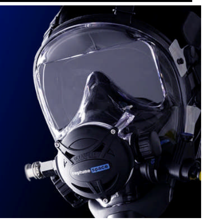
nasal mask, making it the ALL BLACK MASK.

The Raptor is a fully oxygen clean Space mask. The orings are made by Viton and the o-rings lubricant is a Christolube Oxigen Grease. The mask can also be used with conventional air as well. The Raptor distinguishes itself by the black Ixef® polyaramide cover and the black ori-